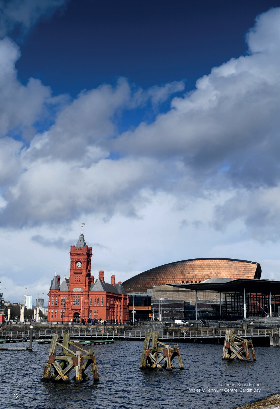
Pierhead, Senedd and Wales Millennium Centre, Cardiff Bay