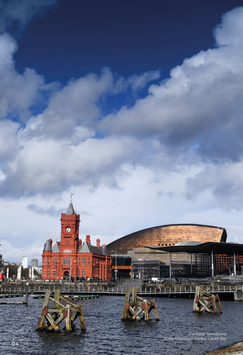
Pierhead, Senedd and Wales Millennium Centre, Cardiff Bay